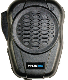
Wireless Remote Speaker Microphone