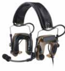
COMTAC IV HYBRID