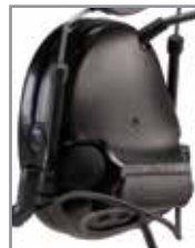
Covert Black (SWATTAC)