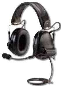
DUAL COMM SPLIT AUDIO*