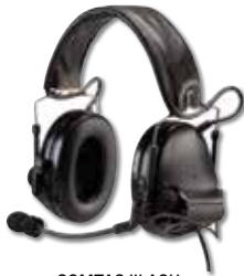
COMTAC III ACH