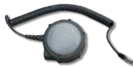
Remote Big Button PTT