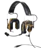
COMTAC IV, Coyote Brown Earcups, Single Comm