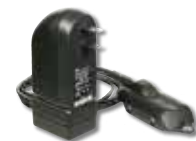
Rechargeable Battery Pack