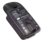
IS Rechargeable Lithium-ion