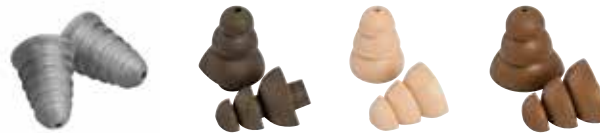
Replacement Communication Eartips