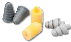
Replacement Communication Eartips