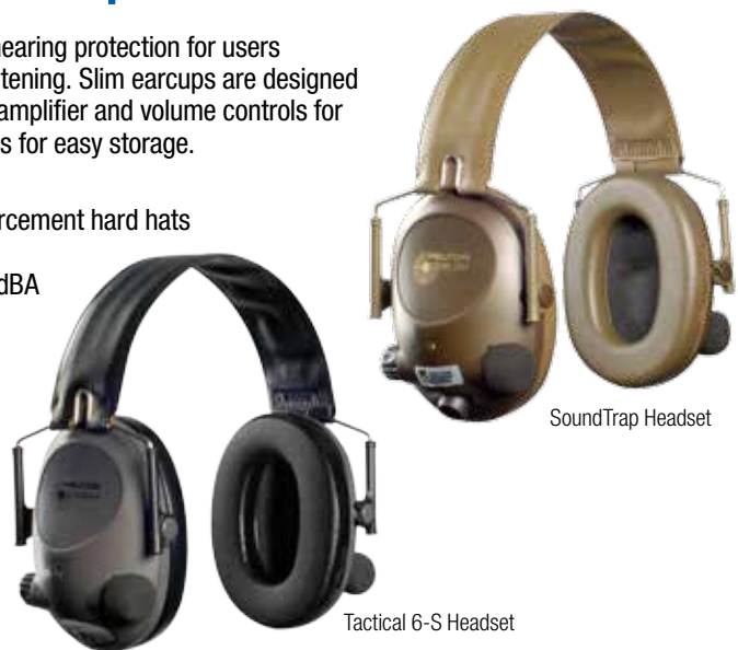
Tactical 6-S Headset