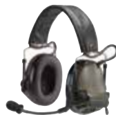
COMTAC ACH, Olive Drab Green Earcups, Single Comm