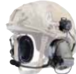
COMTAC ACH, Olive Drab Green Earcups, Single Comm with FAST Hard Hat Mounting Attachment