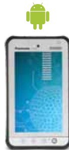
7" TOUGHPAD JT-B1