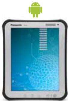
10.1" TOUGHPAD FZ-A1

With more than 24 years of experience designing, testing and building the most reliable professional tablet solutions, Panasonic is unrivaled in offering the best mobile tablet solutions on the market. For combining data and device security, seamless connectivity, enterprise-level technology and worry-free operation, count on Panasonic Toughpad tablets to get the job done.