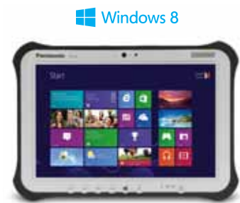
10.1" TOUGHPAD FZ-G1