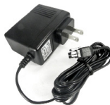
AC Power Adapter