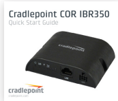
Quick Start Guide