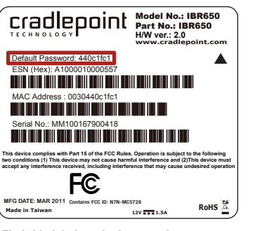
Find this label on the bottom of your router.