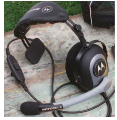
RMN5047A - NFL® Style Headset

"They were using Radius SP50s with a standard headset and boom microphone for a long time to communicate back-and-forth between the press box and the field." Coach Sandifer likes to use every tool in the box, so to speak, and he says that those press box coaches have a completely different perspective that can make a difference in the game.