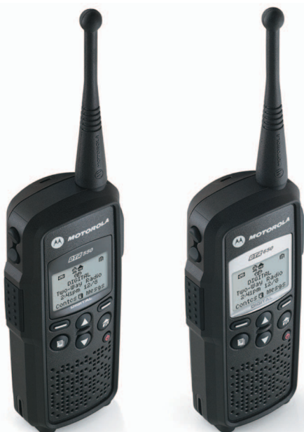
DTR550 and DTR650 Radios

It all adds up to a superb combination of features for your convenience, management, and productivity, all at an extraordinary value.