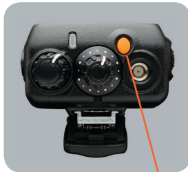
Dedicated Programmable Emergency Button

Industrial and commercial workplace safety programs require emergency preparedness when accidents or hazardous situations arise. This includes a plan to alert help instantly. The Emergency alert function is programmed by your Dealer and is designated to transmit an emergency notice on a specified channel. With a press of a button, the radio transmits an emergency alert to call for help or to notify others to implement the emergency action plan.