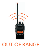
TX/RX Mode Example