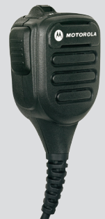
NNTN8382 IP57 Submersible

* For full cleaning instructions, please refer to the INC Remote Speaker Microphone Cleaning Procedures manual that ships with your microphone.