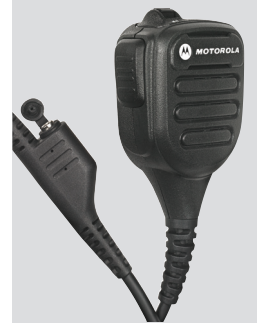
NNTN8383 includes threaded 3.5mm audio jack