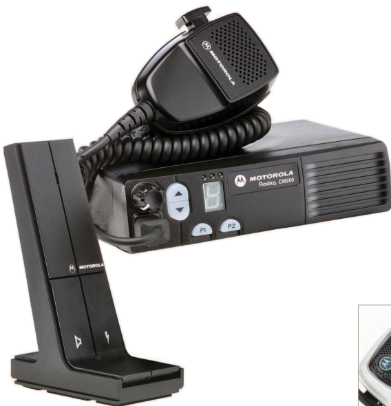
Compact microphone: HMN3596 Desktop microphone: RMN5068

For a detailed listing of all Motorola Original® accessories* available for your CM200 or CM300 mobile radio, see the Commercial Tier Accessories Catalog (RC-3-1008).