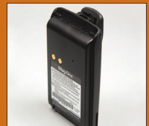
Mag One 1200mAh NiMH Battery PMLN4071_R