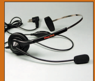
Mag One Ultra Lightweight Headset with In-line PTT/VOX Switch PMLN4445