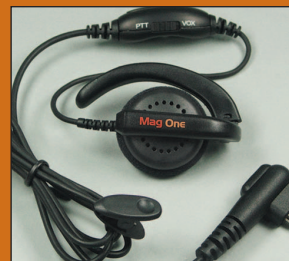
Mag One Ear Receiver with In-line Microphone and PTT/VOX Switch PMLN4443_B