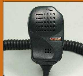
Mag One Remote Speaker Microphone PMLN4008

The following Mag One accessories have been tested with the BPR 40 to ensure maximum performance.