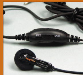
Mag One Earbud with In-line Microphone and PTT/VOX Switch PMLN4442