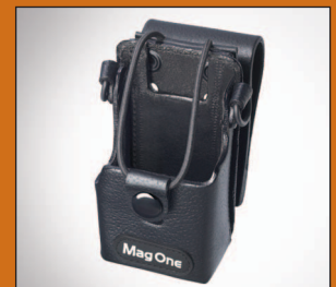
Mag One Hard Leather Case PMLN4742